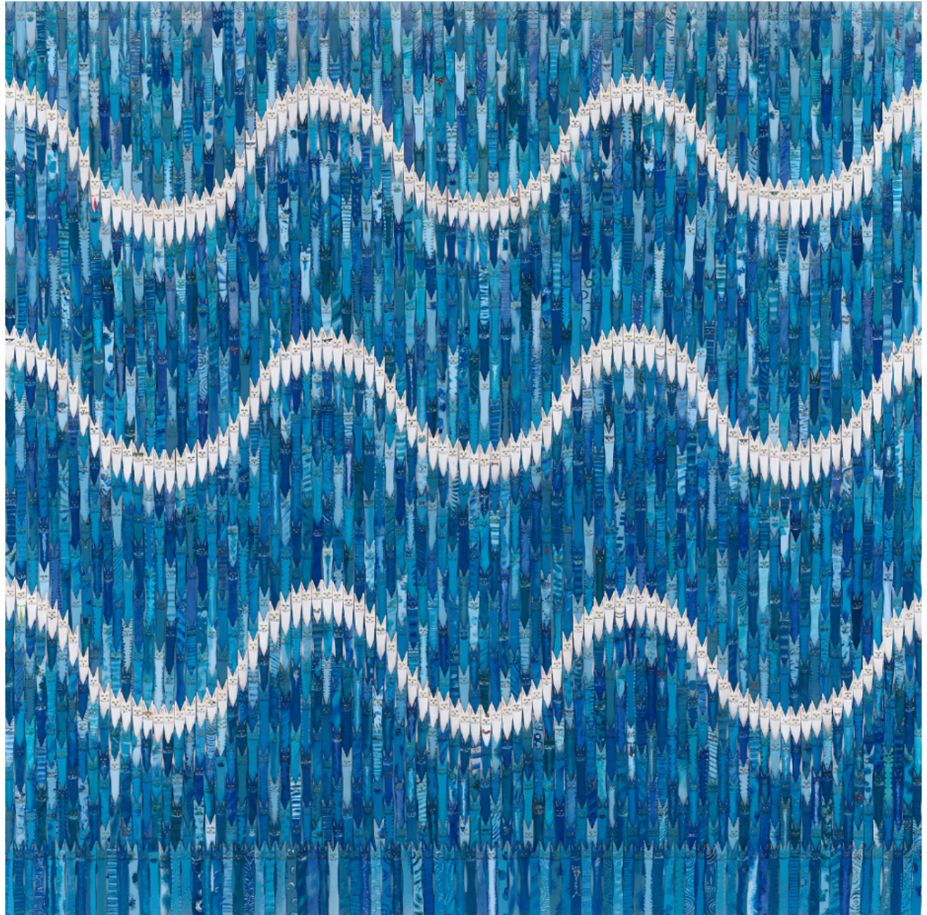
Sechs Katzen Schnorcheln - acrylic on 1893 wooden forks, 100cm X 100cm