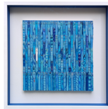
CCCP – acrylic on 8 X 154 wooden forks, 8 X 30cm X 30cm